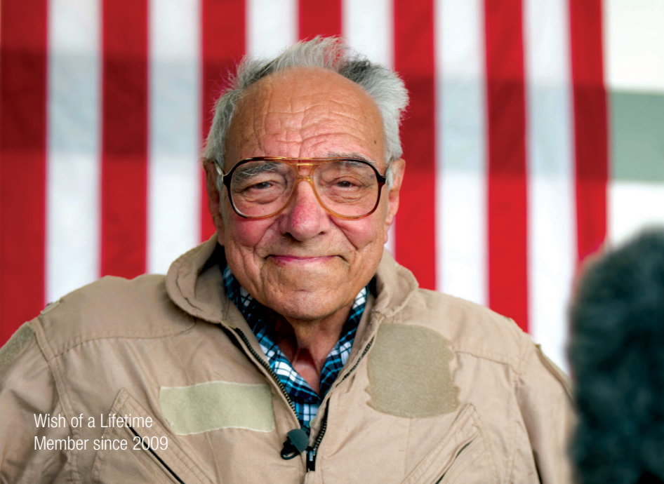
Wish of a Lifetime Member since 2009